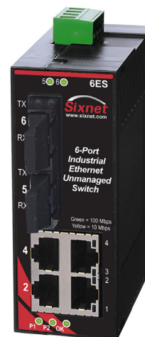
SL-6ES-4/5 Lexan Case Standard Temperature