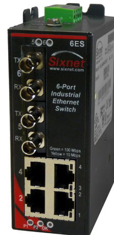
SLX-6ES-4/5 Aluminum Case Wide Temperature

We have been designing industrial hardware such as Remote Terminal Units for over 30+ years and have used this expertise to design the toughest Ethernet switches on the market. Don't trust your critical communications to so-called industrial hardware from commercial switch manufacturers. Sixnet switches give you proven assurance that your system will keep running for years to come.