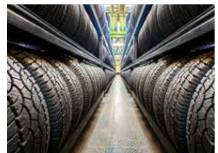
Tires Tracking & Tracing