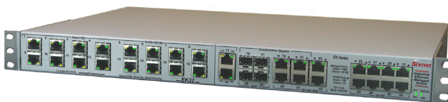
EK32FSD6N-1 with dual 24 VDC inputs and sealed IP50 (no fans!)