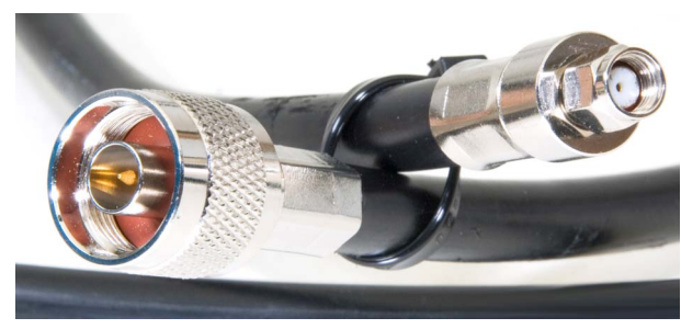
N-TRON ANT-CAB-400-N-RPSMA cable for use with 702-W. N connector is pictured on left and RP-SMA connector on right