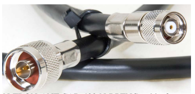
N-TRON ANT-CAB-400-N-RPTNC cable for use with the 702M12-W. N connector is pictured on left and RP-TNC connector on right