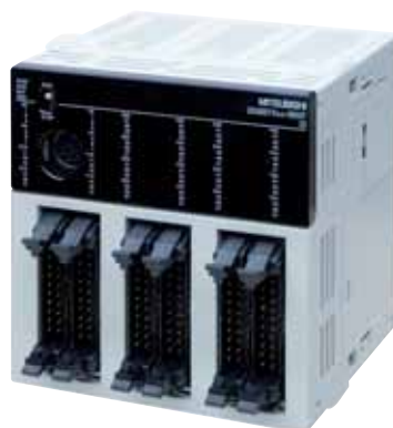
Maximum performance in a compact housing

This makes the FX3UC one of the fastest and most powerful PLC systems in its class. In fact, it puts quite a few larger modular controller systems in the shade.