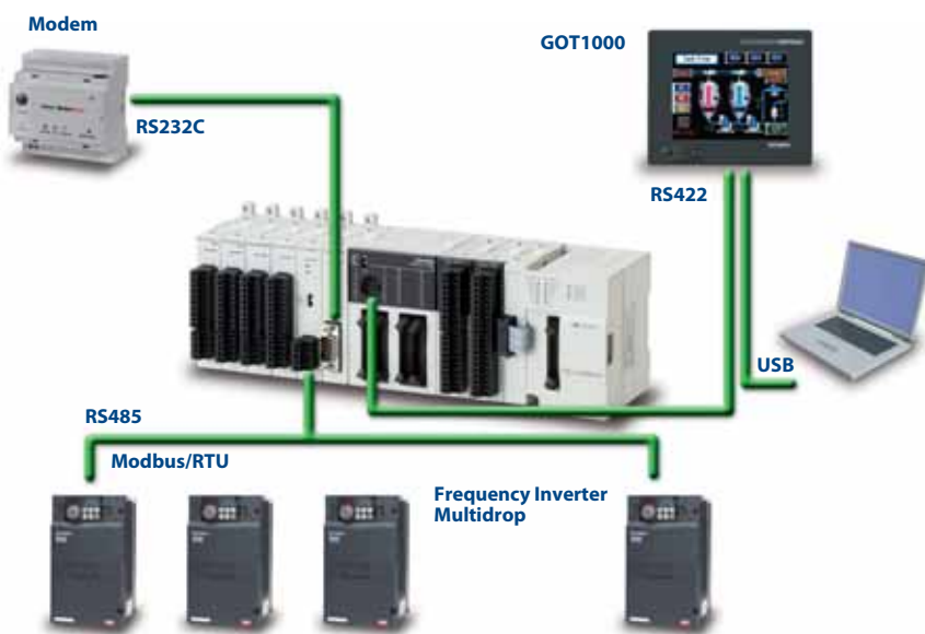
Versatile communication possibilities are covered by the FX3UC.