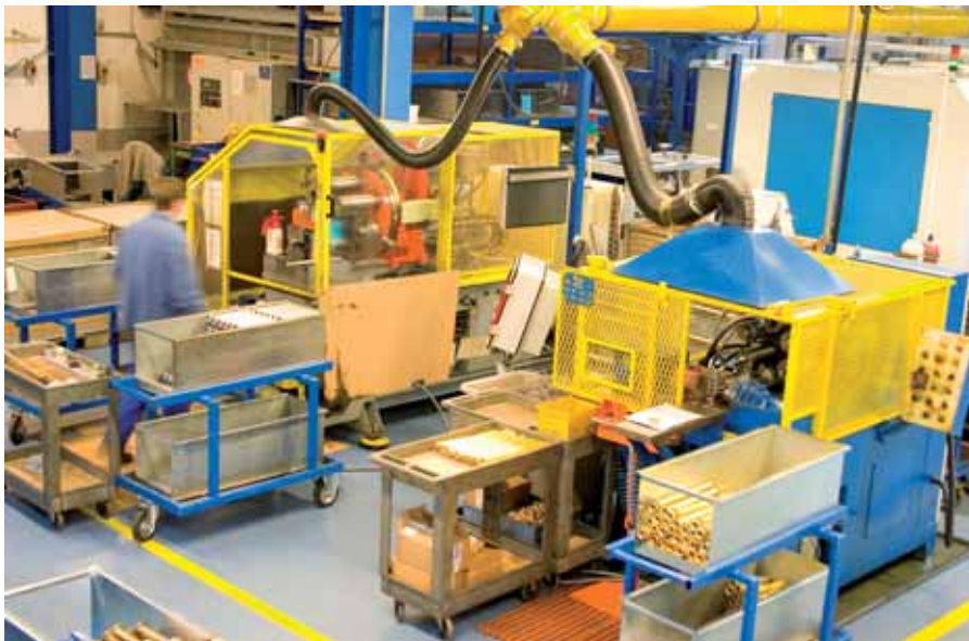
For control applications with limited space the new FX3UC is the right choice.

All of the FX3UC base units have the same CPU and the same performance features, they differ only in the number of integrated inputs/outputs.