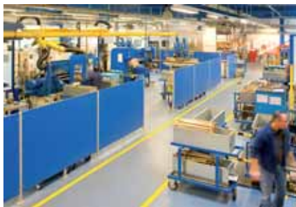
Decentralized installation and networking is one benefit of the FX3UC.

The MELSEC FX3UC controllers are particularly well suited for applications in areas, where installation space is very limited or decentralization is needed.