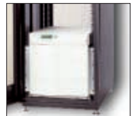
Powerware 9170 shown installed in a standard 19" computer rack.

Unique to the Powerware 9170 is its global deployment capability. By using a high frequency design, housing both logic and power in the power module, and offering a single cabinet design, distributors and purchasing departments around the world will have fewer system components to contend with, regardless of where the system is deployed.