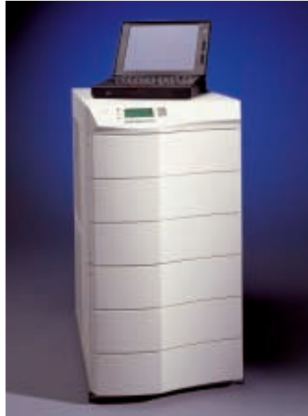
A dynamic innovative solution for the changing global customer landscape

The emergence of the e-business economy has demonstrated a new standard in system availability: zero downtime. This standard ranges from the largest data centers of the Internet and e-business infrastructure, to the server farms, networks, telecommunications and Internet service providers (ISP) that are quickly becoming the foundation of all business worldwide. This, in turn has been driving the most aggressive wave of innovation in power technologies, specifically UPS, in decades. The new e-business economy is also driving a requirement that technological solutions be quickly and easily deployed on a global basis.