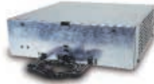
3 kVA Power or Charger Module (1 per slot)