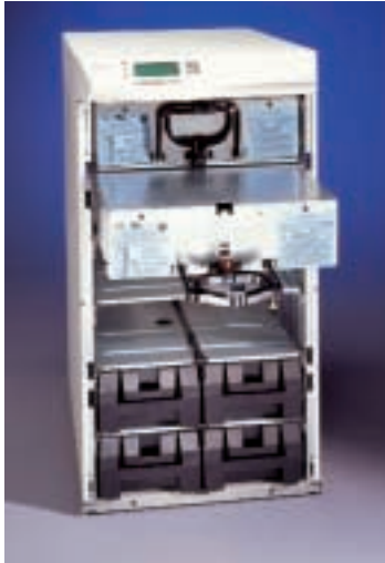
Powerware 9170 6-slot configuration