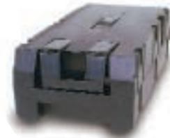
Battery Module (2 per slot)