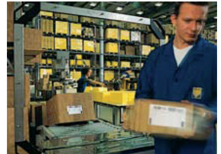
Manual Postal sorting