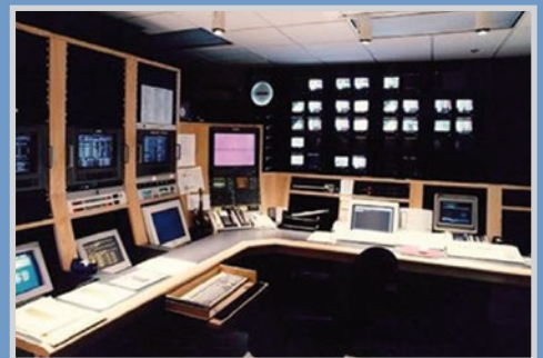
Remote Diagnostics by Datalogic WebSentinel™