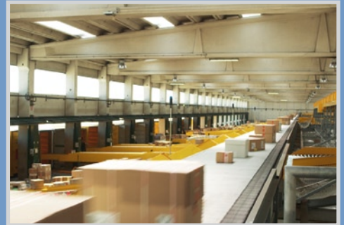
Postal and Courier Express sorting