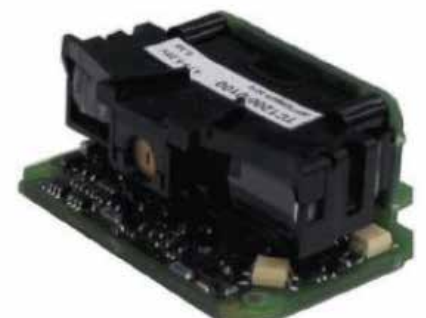
TC1200 SCAN ENGINE MODEL