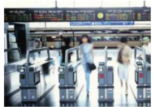
Access control and Ticketing