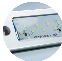
CRYSTAL CLEAR POLYURETHANE RESIN