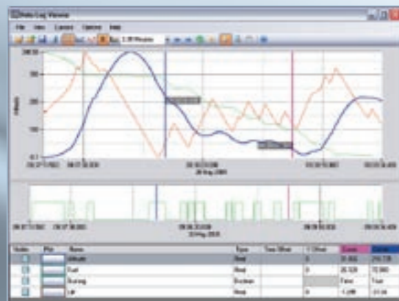
New data logging.

With a brand new data table, created by bringing the vertical and horizontal cursors together, you can analyse your machine's performance in minutes. Reporting is also easier: now you can export data as an image, CSV or directly to a printer.